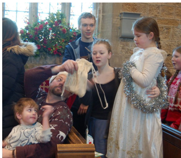
Pass the parcel

When the music stopped, a figure was taken out of the parcel and placed in the Nativity scene, while the person holding the sweets took one.